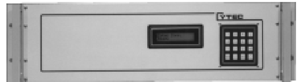
VDX/32x32 Chassis w/ Keypad Manual Control