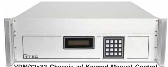
VDM/32x32 Chassis w/ Keypad Manual Control

This optional front panel control includes a keypad and LCD Display. The operator can open, close and verify the status of any switch point.